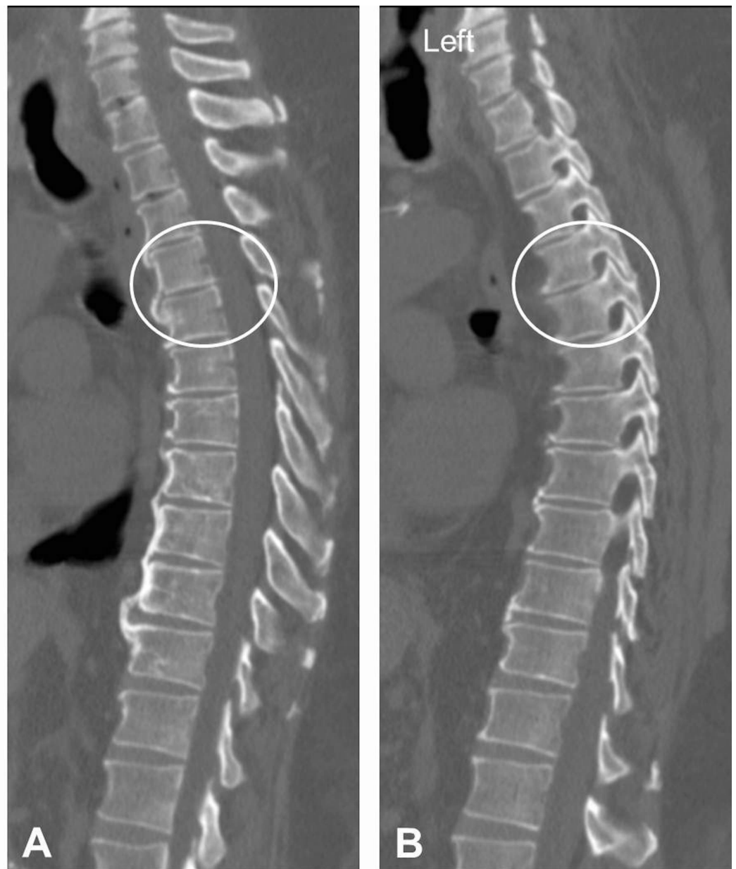
FIGURE 3: CT Following Recumbency Treatment

A sagittal CT 16 weeks after recumbency treatment of the extension injury shows normal anatomic alignment of the thoracic spine as well as fracture healing with anterior osteophyte bridging between T4 and T5 (A, circle). A left parasagittal cut shows restoration of alignment and no distraction at the level of the facet joint (B, circle).