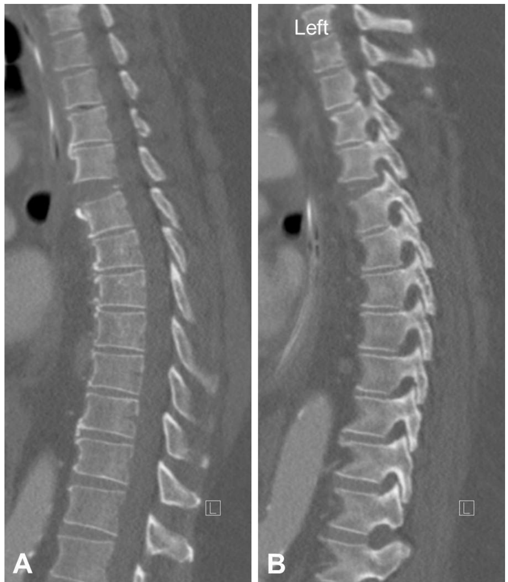
FIGURE 1: Sagittal Computerized Tomography (CT) of Injury

both occasions failed. The initial attempt failed due to difficulty in ventilating the patient during prone positioning. The latter failed due to cardiopulmonary arrest and hemodynamic instability during prone positioning for surgery.