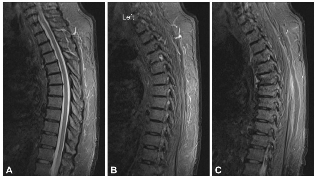
FIGURE 4: MRI Following Recumbency Treatment

An MRI short tau inversion and recovery (STIR) sequence demonstrates normal signal intensity at the level of the anterior longitudinal ligament, disk, and posterior ligamentous complex (interspinous and supraspinous ligaments) at the level of T4/5 and bone osteophyte formation (A). A left (B), and right (C) parasagittal image shows normal signal intensity at the level of previously disrupted facet joints.