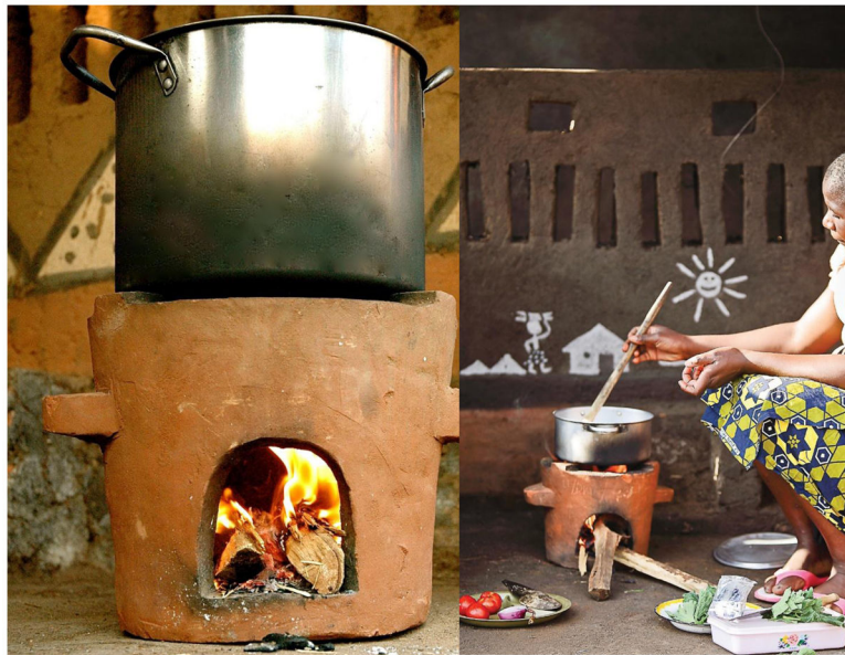
1a: Chitezo mbaula