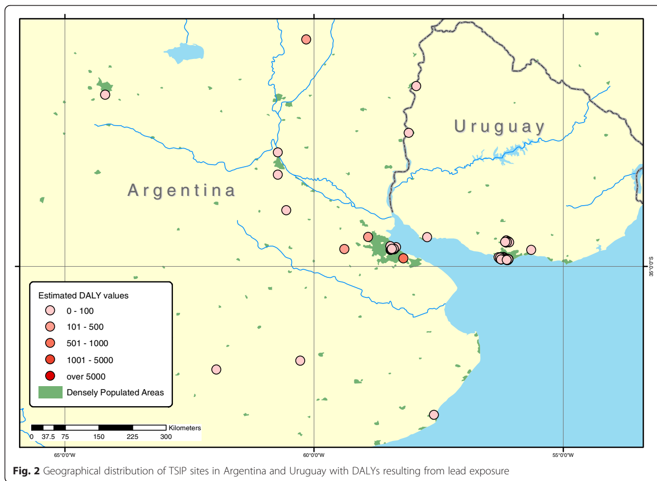
Fig. 2 Geographical distribution of TSIP sites in Argentina and Uruguay with DALYs resulting from lead exposure

calculation of disease burden for lead exposure in Mexico and Uruguay, accounting for 47.4 % of the DALYs estimated in those countries.