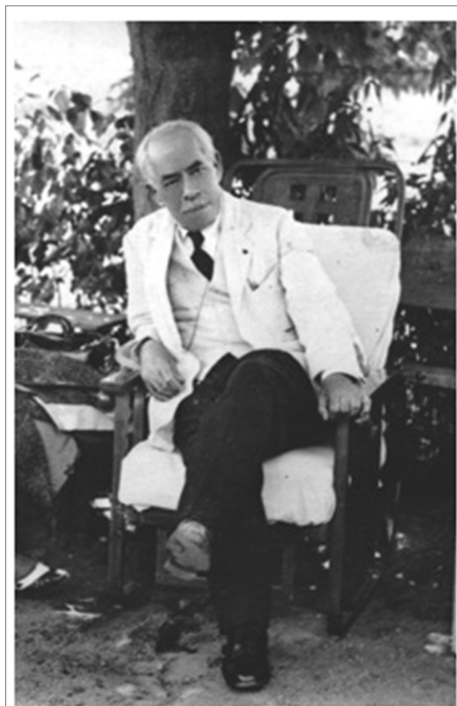
FIGURE 1 | Georges Marinesco, in the 20's.

Georges Marinesco (1863–1938, Figure 1 ) was one of the most influential Romanian and European neuroscientists at the