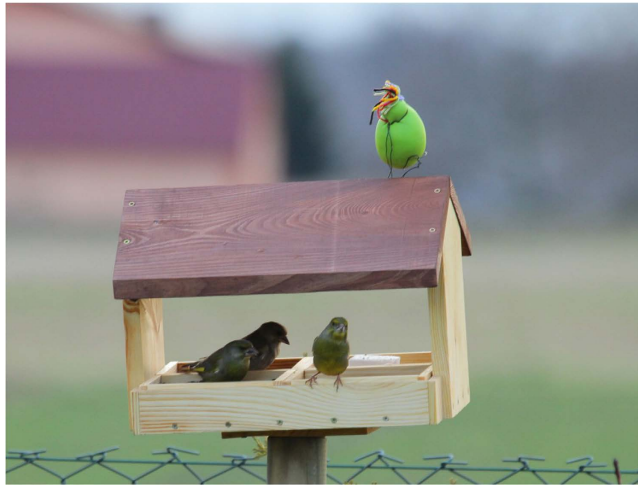
Figure 3. Bird-feeder with greenfinches Chloris chloris in the presence of the novel object.

Recruitment in winter to novel bird-feeders by common bird species depended on the presence of a novel object and, importantly, the interaction between habitat and object. We interpreted this difference as an effect of exploration and neophobia 4 . Because so many birds, both species and individuals, responded differentially to the presence of a novel object in the urban, compared to the rural habitats, we suggest that colonization of urban habitats is by individuals with high levels of exploratory behaviour and low levels of neophobia allowing for exploitation of such novel environments. We documented similar effects in great tits and in the urban bird community at large, although the effect size was larger for tits than for the entire community, because great tits explored bird-feeders faster than other birds 25 . The statistically significant and large interaction between habitat and presence of the novel object implies different patterns of feeder use in the presence and the absence of the novel object. There are dangers of novel food 29 including exposure to the enemies living in the neighbourhood of such novel feeders 9,30–32 . Our experiments do not allow discrimination between effects of habituation, differential dispersal of phenotypes and micro-evolutionary change as determinants of these behavioural differences between paired rural and urban study plots 19,33 .