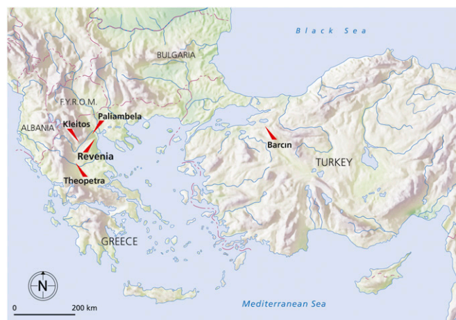
Fig. 1. North Aegean archaeological sites investigated in Turkey and Greece.

presence of domesticated forms of plants and animals indicates nonlocal Neolithic dispersals into the area.