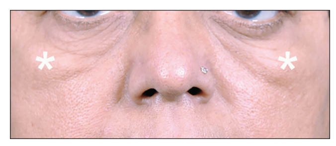
Figure 5: Figure showing the triangular malar mound in a middle-aged person. It is bound supero-medially by the orbital rim hollow, and infero-medially by the zygomatic hollow

The volumetric changes in the lower eyelid require a customised approach. I personally prefer to first establish an anatomic definition for the patient's 'tired look'. Is it the fat bag? Or is it the orbital rim hollow? Going through the previous photographs of the patient often helps determine which finding has appeared recently. It is always helpful to 'rewind' the years by addressing that recent change, rather than give a new look to your patient.