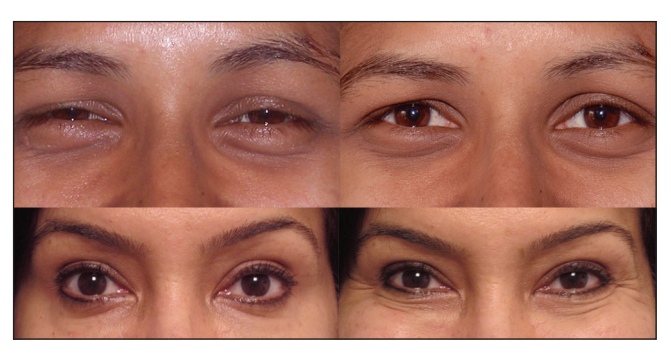
Figure 3: The orbicularis roll. Note the reduced palpebral fissure height upon smiling due to the orbicularis roll in a young person (top left). The same after two units of Botulinum toxin in the mid-pupillary plane in the pre-tarsal orbicularis of the lower eyelid (top right). Note the widened palpebral fissure with the same amount of smile expression. With ageing, the static lines (bottom left) and dynamic lines (bottom right) over the orbicularis roll increase

This could be considered as the commonest lower lid 'hill' that presents to the aesthetician. Orbital fat prolapse