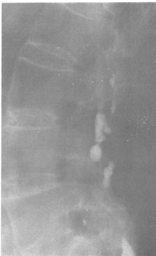
FIG. 2 Case 1. Oil myelogram showing posteriorly situated diverticula in the lumbar theca (patient supine).

neurological symptoms and their long duration account for the difficulty in early recognition of the cauda equina syndrome in patients with ankylosing spondylitis in whom pain in the buttocks and thighs may be attributed to sacroiliac joint inflammation.