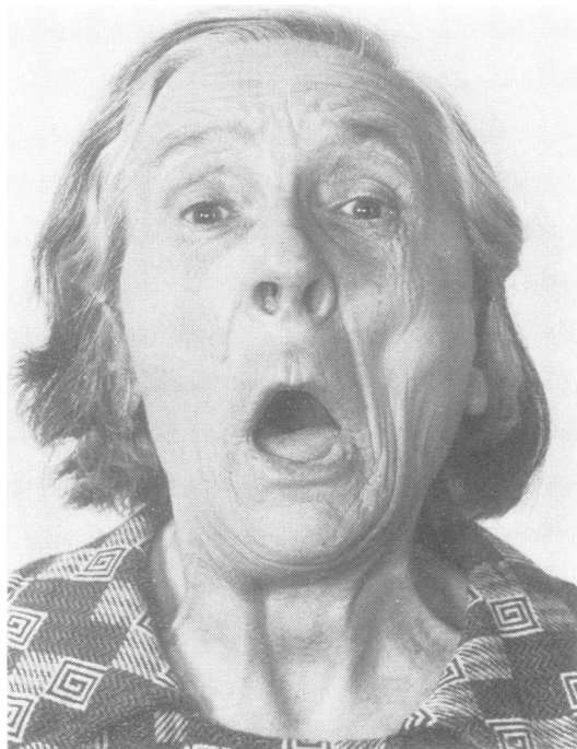
FIG. 3 Spasm of jaw opening and mouth retraction in a 65 year old lady with symptoms for four years.

Nine patients had isolated oromandibular dystonia, with spasms of mouth and jaw closure in five and of mouth and jaw opening in four. Contractions of the lower perioral facial muscles and platysma accompanied the jaw spasms in all patients, but the eyes were spared. The oromandibular dystonia in these patients was similar to that seen in those with blepharospasm as well. In seven patients the jaw would open forcibly with mouth retraction, and sometimes tongue protrusion (Fig. 3). In the remaining two patients the spasms were of jaw closure and mouth pursing. Speech was affected in all, and the initial difficulty was confined to muscle spasms on speaking in four patients and on singing in one. One patient could not speak without developing spasms of jaw opening but could