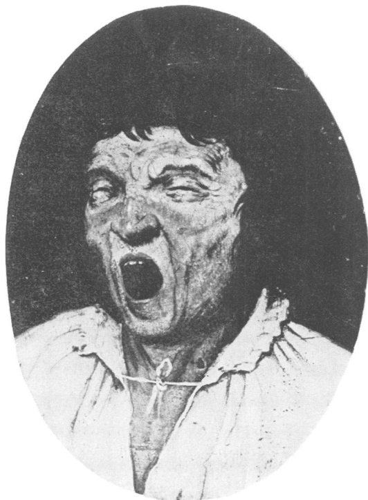
FIG. 1 'De Gaper', by Pieter Brueghel, The Elder (c. 1525–1569).

but became more frequent and prolonged with time. They might last from a few seconds to as long as 20 minutes or so, and could occur as frequently as every 15 to 20 seconds. Many of these patients were rendered functionally blind, and could not leave the house or cross the road. The spasms were provoked characteristically by bright sunlight (many wore dark glasses), watching television or reading, embarrassment, and fatigue. Many patients had discovered