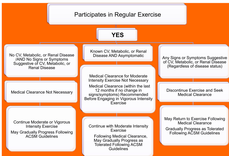
Fig. 2 Prepar-cipa-on Clearance

person who does NOT participate in regular exercise, known cardiovascular, metabolic or renal disease, or signs and/or symptoms of disease should prompt medical clearance. However, for the person who is regularly physically active, the presence of known disease, albeit asymptomatic, does NOT prompt the need for medical clearance for moderate intensity physical activity. Medical clearance would be advised if there was a desire to increase exercise intensity to vigorous [21].