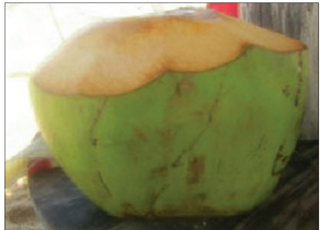
Figure 2: Young coconut fruit