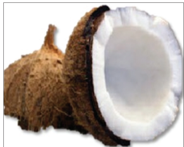
Figure 3: Mature coconut fruit