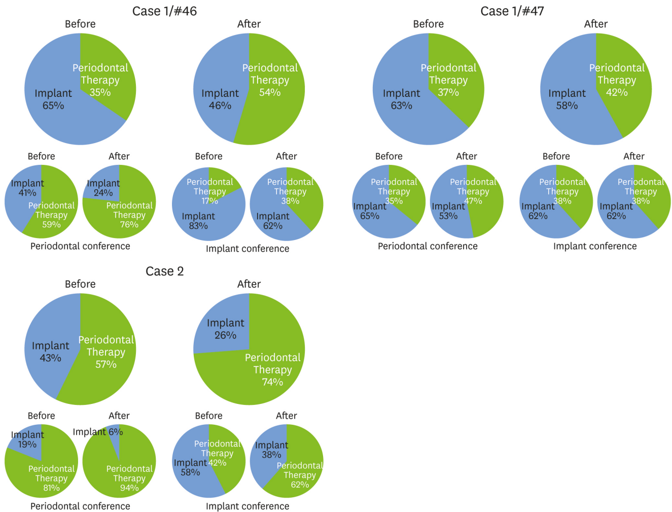
Figure 2. Preferences of the participating dental clinicians regarding treatment decisions for each multirooted tooth in the first and second case modules. The upper two circle graphs in each panel present the proportion of preferences for periodontal therapy (to save the tooth) or placement of a dental implant (after removing the tooth), immediately before and after the debates. The lower graphs show subcategorized results from the periodontal and implant conferences. A tendency was noted among the participants in the periodontal conference to prefer periodontal therapy over dental implants. The preference for periodontal therapy increased after the debates and was also greater in the second case than in the first case.