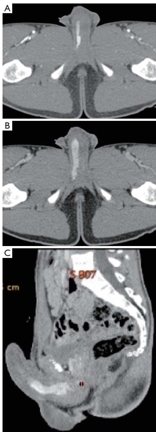
Figure 1 Axial contrast-enhanced CT scan at the arterial (A) and venous (B) phases with sagittal reconstructions (C) showing an arteriocavernosal fistula involving the right corpora cavernosa and arising from the cavernosal branch of the right internal pudendal artery.