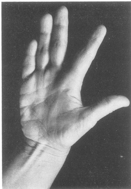
Fig. 1 Case 1. Wasting of the thenar and hypothenar muscles and of the interossei in right hand.

tennis regularly and manages her family without difficulty.