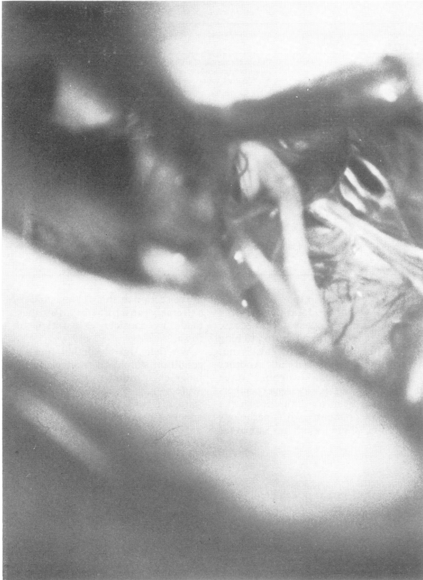
Fig. 2 Eighth nerve retracted by the sucker to show the facial nerve split into two by the anterior inferior cerebellar artery.

this operation (Scoville, 1969a; Janetta, 1976). In particular deafness of a varying degree is common, and it should certainly be explained to the patient before operation that such a complication is possible. Contralateral deafness may be a contraindication to this procedure.