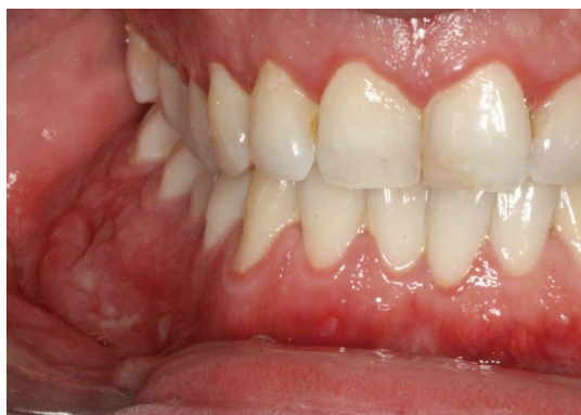
Figure 1 Cobblestoning and ulcerations in Crohn's disease.

Specific oral lesions in patients with CD include a cobblestone appearance of the oral mucosa; deep linear ulcerations; mucosal tags; swelling of the lips, cheeks and face; lip and tongue fissures; and mucogingivitis [15,19,21,22,25,31] . The mucosa of the oral cavity is hyperplastic and resembles a "cobblestone", which marks the nodular, granulomatous swelling of the oral mucosa (Figure 1). In addition, there are also indurated polypoid fringe-like lesions of the vestibule and the retromolar region. Mucosal tags and deep ulcerations with hyperplastic edges, firm or boggy to palpation, are mostly present in the labial and buccal mucosa and in retromolar regions. Attached gingiva and alveolar mucosa become swollen, granulated and hyperplastic with or without ulcerations [19,32] . Edema of the face, of one or both lips and of the buccal mucosa may also occur. This condition is unpleasant for patients because it can lead to facial deformation [15,19,22,25] . Non-caseous granulomatous inflammation [33] can be histologically detected in such lesions. The lips are the most commonly affected, and they are usually painless, tender and firm to palpation [34] . Numerous patients with swollen lips also develop painful vertical fissures where many microorganisms can be isolated [35] .