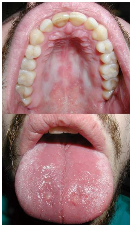
Figure 3 Pseudomembranous candidiasis on the palatal mucosa and atrophic candidiasis on the tongue in a Crohn's disease patient treated with anti-TNF and prednisone.

is rare, and only a few cases have been described [85] . Some patients receiving sulfasalazine may complain of a metallic taste in the mouth [72] . Patients suffering from inflammatory bowel diseases who are receiving sulfasalazine can also develop oral complications caused by myelotoxicity and hepatotoxicity due to the sulfasalazine treatment, presented through signs of aplastic anemia, bleeding (ecchymosis and petechiae) and oral infections. Side effects of 5-ASA derivatives (non-sulfa-containing drugs) are less numerous [88] but have been described in the literature [89] . Mesalazine can cause hematological side effects, such as leucopenia, thrombocytopenia and aplastic anemia [89] , resulting in alterations in the oral cavity. Alstead et al. [85] presented a case of a patient who developed oral lichen as a reaction to sulfasalazine, which was replaced with mesalazine, but the lesions did not withdraw. After withdrawing the mesalazine, the oral lesions withdrew, and the authors concluded that the lesions were related to 5-ASA.