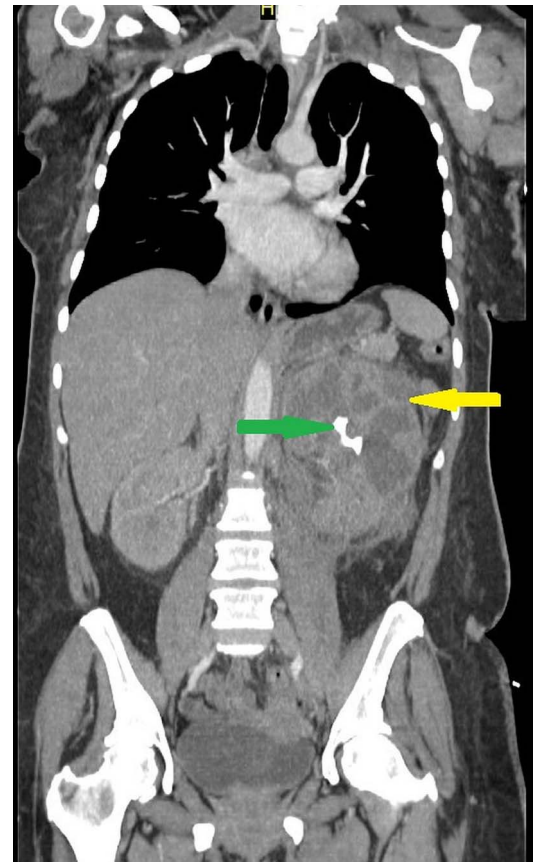
Figure 2 (A) CT scan of the abdomen and pelvis showing xanthogranulomatous pyelonephritis (yellow arrow) and stag horn calculus at the renal pelvis (green arrow).