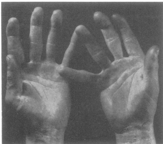
FIG. 1. Photograph of hands showing permanent flexion of terminal phalanges of all fingers on left and of index and middle fingers on right. In addition there is abduction of the left little finger.

no beneficial effect. Procaine amide 600 mg by slow intravenous infusion did not alter the fasciculation but caused some reduction in the rigidity. Oral dosage up to 1 g four times a day had no convincing effect.