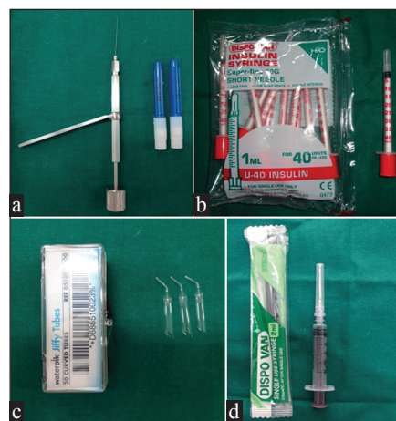
Figure 2: Four different obturation methods: (a) Endodontic pressure syringe. (b) Insulin syringe. (c) Jiffy tube. (d) Local anesthetic syringe

Twenty-four prepared root canals were obturated using a local anesthetic syringe. A local anesthetic syringe (Disposable 2-ml syringe DispoVan, Hindustan Syringes