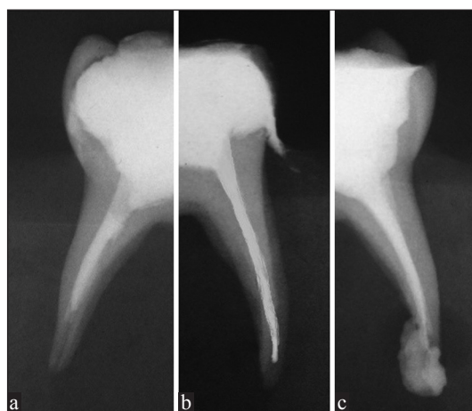
Figure 4: Intraoral periapical radiographs showing the quality of obturation. (a) Under fill. (b) Optimum fill. (c) Over fill

For the overall comparison of quality of root canal obturation, Chi-square test was used which detected significant differences ( P < 0.001 ) between the four groups. Table 1 shows the frequencies of each root canal filling score in all four groups. The endodontic pressure syringe scored best (score — 2) for the length of root canal filling (95.8% optimal fillings) and the jiffy tube scored