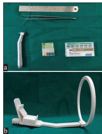
Figure 3: (a) Armamentarium. (b) Rinn XCP instrument for radiographic film positioning