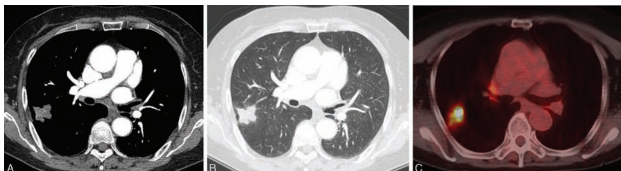
Figure 3. A 73-year-old asymptomatic woman with an SPN. A, Contrast-enhanced CT shows a lobulated nodule with poor contrast enhancement with a mean attenuation value of 33 HU. B, Lung window CT image showed a nodule with a lobulated contour in the right upper lobe. No abnormal findings such as bronchiectasis or clustered small nodules in the remaining lungs were noted. C, Fused axial image from 18 F-FDG PET/CT showed strong FDG uptake (SUV max , 7.8). This patient underwent surgical resection (right upper lobectomy) without PCNB. Surgical specimen showed chronic granulomatous inflammation and was positive for NTM-PCR. D, Fused axial image. CT=computed tomography, FDG=fluorodeoxyglucose, MAC= Mycobacterium avium , NTM=nontuberculous mycobacterial, PCNB=percutaneous needle aspiration biopsy, PCR=polymerase chain reaction, SUV max =maximum standardized uptake value.

Calcification can be seen in both benign and malignant lesions, but is more frequently observed in chronic inflammatory diseases such as tuberculosis or histoplasmosis. Relatively high incidence of calcification in our patients may aid in the correct radiologic diagnosis of NTM disease. It is also noteworthy that NTM pulmonary disease may manifest as a solitary lesion without