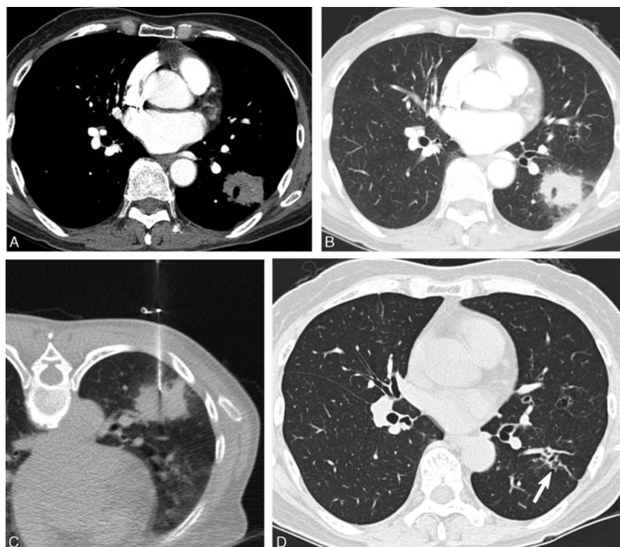
Figure 4. A 61-year-old asymptomatic woman with a mass-like consolidation. A, Contrast-enhanced CT showed a mass-like consolidation with poor contrast enhancement with a mean attenuation value of 39 HU. B, Lung window CT image showed an irregular border and ill-defined ground-glass opacity adjacent to the mass-like consolidation. C, CT-guided PCNB using a 22-gauge Westcott needle showed chronic granulomatous inflammation. Culture of PCNB aspirates revealed the presence of Mycobacterium intracellulare organisms. D, Follow-up CT obtained 2 years after anti-MAC antibiotic treatment showed complete resolution with minimal fibrotic change (arrow). CT=computed tomography, MAC= Mycobacterium avium , PCNB=percutaneous needle aspiration biopsy.

alleged typical imaging features of NTM disease such as cellular bronchiolitis with or without bronchiectasis (i.e., nodular bronchiectatic form) or cavitary lesions with upper lung predominance (i.e., upper-lobe cavitary form). None of the solitary lesions in our study had concomitant typical radiologic