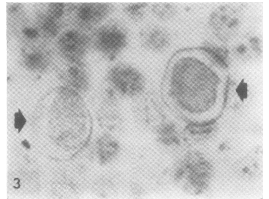
Figs 2 and 3 Chlamydia trachomatis inclusions (arrowed) in McCoy cells. Periodic acid-Schiff stain \times 400 (original magnification).

Table 1 shows results of three experiments comparing counts on coverslips stained either with PAS (examined using transmitted illumination) or with Giemsa (examined by dark-ground microscopy). Inclusion counts by the two staining methods were comparable and altered little during the period 48 to 96 h after inoculation. When screening coverslips for evidence of infection, inclusions stained by PAS were more readily apparent, being easily detected even at a magnification as low ( \times 47 ) as that used to scan tissue-cultures for viral cytopathic effects.