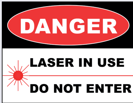
Figure 2. Warning sign