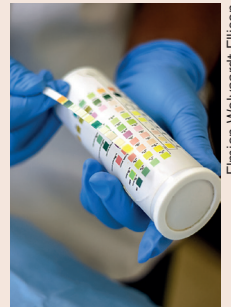
Figure 2. Read the strip against the colour chart on the container. Be careful not to allow the strip to touch the container