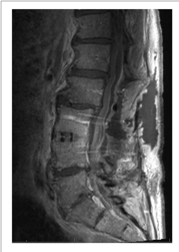
Figure 2. T1-weighted image with contrast taken 5 days after epidural drainage, demonstrating complex fluid collection identified at surgery as a subdural abscess.

at L4–5 was removed, and a midline incision in the dura was made. There was a thick phlegmon tightly adherent to the nerve roots and dura. After careful debridement, the subdural space was irrigated with a vancomycin solution using a red rubber catheter. When irrigating cranially, only clear fluid returned. Caudally, there appeared to be more phlegmon, so an L5 laminectomy was performed. Incision of the dura at this level expressed frank pus, and there was again thickly adherent phlegmon. After debridement, the subdural space was again irrigated with vancomycin solution and the dura was closed. The previous dural tear could not be approximated, and it was covered with a muscle patch. Tisseel was placed over the suture line; no CSF leak was noted with Valsalva maneuver.