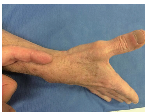
Figure 2 Examiner's finger pointing to extensor pollicis brevis tendon which is extending thumb at MP and IP joints.

a large bony osteophyte protruding dorsally from the scaphoid. The impression was that the EPL tendon had ruptured over the dorsal spike from the scaphoid as this was directly underlying the normal course of the EPL tendon and there was concern that his wrist extensors might also rupture over the bony spike. Therefore, a magnetic resonance imaging of the right wrist was obtained which revealed that the extensor carpi radialis longus (ECRL) tendon was 50% eroded over the dorsal spike of the scaphoid nonunion and that the EPL tendon had completely ruptured. After discussion with the patient, it was decided to perform a surgical procedure to debride the bone spike from the scaphoid nonunion that could potentially lead to rupture of his wrist extensor tendons, having already ruptured the EPL tendon. Since he had no pain in the wrist nor deficits of thumb IP joint extension we did not plan to perform any procedure to address the arthritis or the EPL rupture. At the time of surgery, which was performed under a regional anesthetic, the EPL tendon was seen to be completely ruptured with the proximal end retracted and the ECRL tendon was 50% eroded. The sharp spikes from the scaphoid nonunion were debrided and the capsule was closed over the scaphoid as a soft tissue interposition between the bone and the wrist