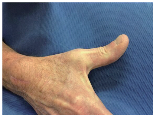
Figure 1 Patient demonstrating full thumb MP and IP extension using only extensor pollicis brevis tendon.

A 64-year-old right handed man had sustained a right wrist scaphoid fracture in 1969 which went on to develop a scaphoid nonunion advanced collapsed deformity (SNAC wrist) with arthritic changes and a large bone spur from the dorsal scaphoid. Nevertheless, he had no wrist pain and the right wrist never bothered him enough to warrant treatment. Six weeks prior to presentation, he was reaching for something and felt a pop in his right wrist. His physician referred him for hand surgery evaluation. On physical examination his right wrist extended to 30 degrees and flexed to 30 degrees compared to 45 degrees and 70 degrees respectively on the left wrist. His right wrist had bony enlargement dorsally on the radial side, but was non-tender and there was no pain with motion. His EPL tendon was noted to be completely ruptured. However, his EPB tendon could visibly fully extend both the thumb MP and IP joints (Figures 1-3). His active thumb motion was 0-60 degrees at the MP joint and 15 degrees of hyperextension to 50 degrees of flexion at the IP joint. The only difference between the right and left thumbs was that when his hands were put flat on the table, he was unable to fully lift the right thumb up off the table compared to the left side (Figure 4 and Video core tip 1). X-rays of his right wrist revealed a SNAC wrist with