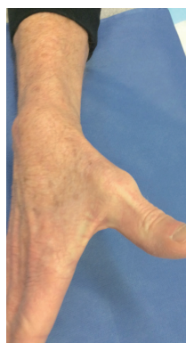
Figure 4 Extensor pollicis brevis tendon extending thumb (Video core tip 1).

extensor tendons. Post-operatively, he was immobilized for 10 d at which time the sutures were removed and