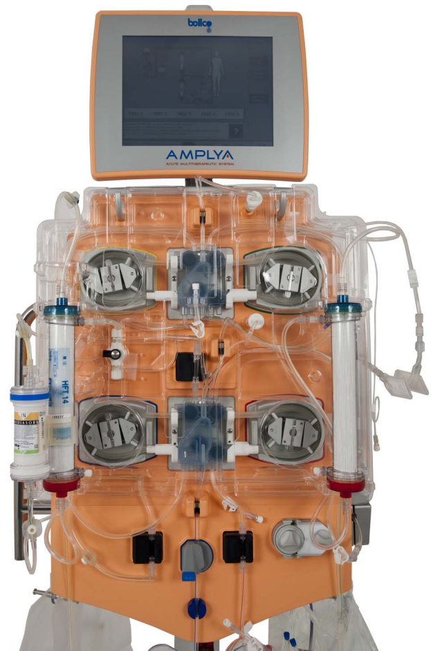
Figure 1 AMPLYA system from Bellco Societa unipersonales a r.l. The resin cartridge and plasma filter are in position and ready for use. The copyright holder (Bellco) has approved the usage of this figure.

CPFA was first used in the late 1990s with subsequent publications of several small observational clinical reports and case studies. 20–26 A few years ago, a large randomised multicentre controlled trial was performed by a group of Italian intensive care physicians, GiViTI, but the trial was stopped for futility. 27 Factors leading to early stopping were extensively analysed by the investigators and focused primarily on technical problems and the inability to achieve an appropriate dose of treated