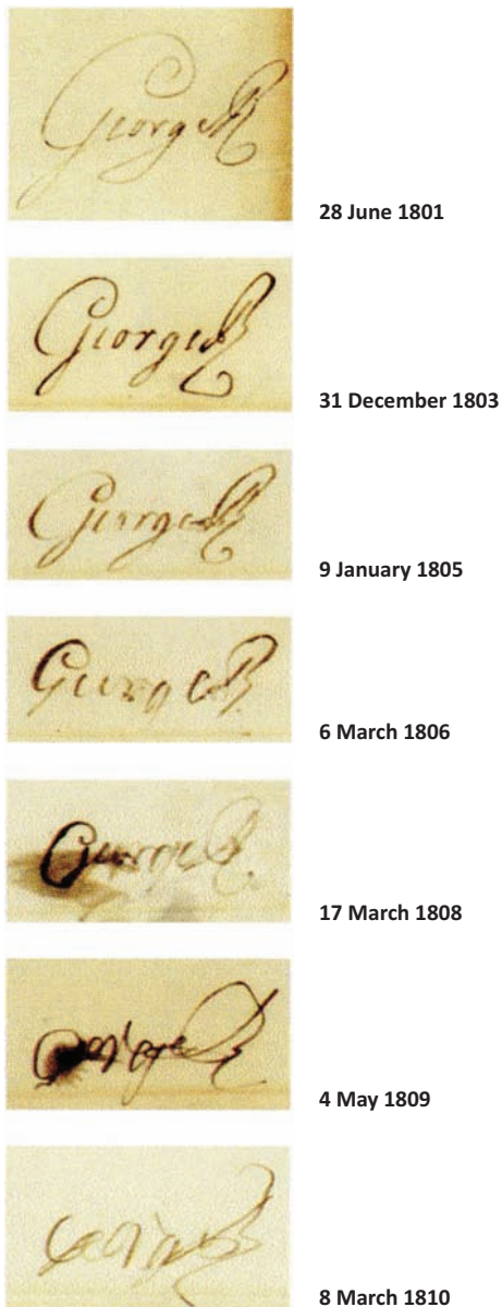
Fig 2. Signatures of George III taken from his annual letters to his bankers, Messrs Drummonds (28 June 1801– 8 March 1810). Reproduced with permission. 24