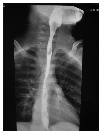
Figure 2: Upper contrast study normal oesophagus diameter with regular wall