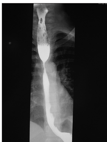
Figure 1: Upper contrast study oesophageal stenosis

The patient had two pneumatic dilations at a 2 months interval with local steroid infiltration hydrocortisone hemisuccinate (HSHC).