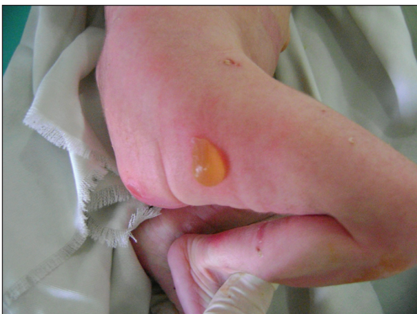
Figure 5: Bullous skin lesions with erosive scars

Prenatal diagnosis of PA by ultrasonography is possible. Anatomic stomach features can be studied from the 14 th gestation week. Diagnosis is frequently based on the association of polyhydramnios with gastric enlargement. [17,18]