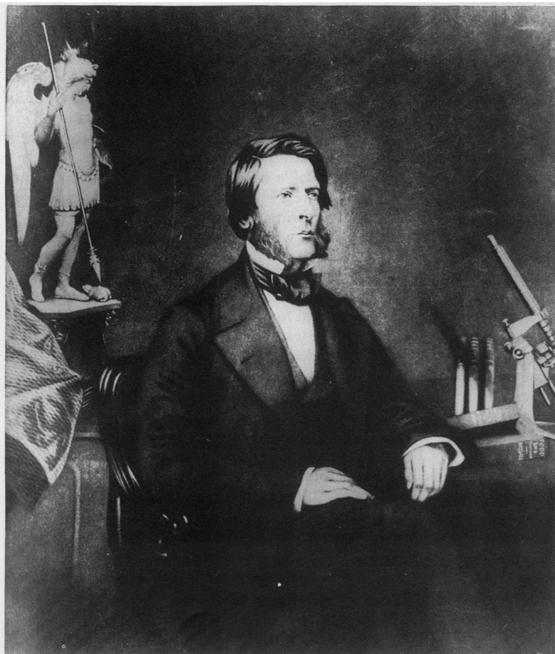
Figure 1 Arthur Hill Hassall MRCS, LSA, MB, MD (1817-94).

These characteristic structures, found in the medulla of the thymus, were named as "the concentric corpuscles of Hassall" by Friedrich