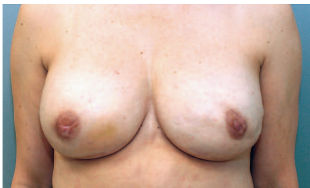
Fig. 4. Patient had no significant nipple loss and negligible depigmentation. She successfully completed her NSM and second stage reconstruction.

lar dermal matrix was performed by a single plastic surgeon after mastectomy.