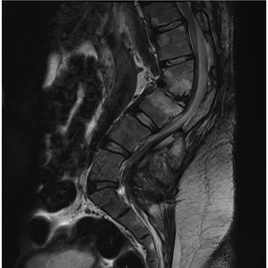
FIGURE 3: Preoperative Sagittal MRI

T2 weighted sagittal MR image demonstrating kyphosis at L2-L3 and spinal stenosis at the area of the pseudoarthrosis