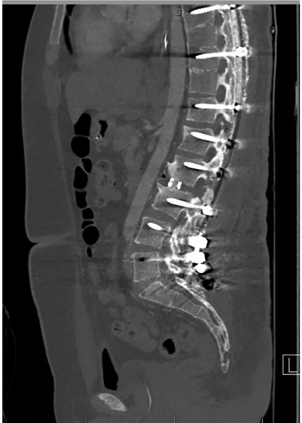
FIGURE 5: Postoperative Sagittal CT Image

Immediate postoperative sagittal CT image demonstrating satisfactory placement of hardware, and complete correction of kyphotic deformity using Ponte osteotomy and posterior interbody fusion technique