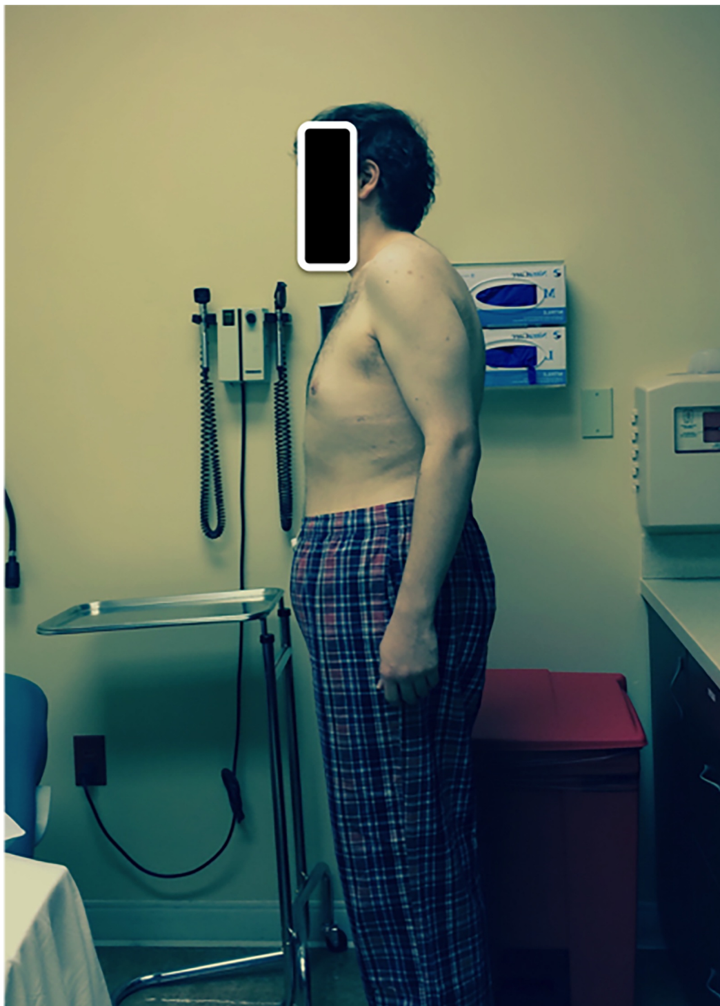
FIGURE 6: Postoperative Clinical Photograph

The patient was discharged on postoperative day eight. At the six-month follow-up, his posture was normalized, and he regained horizontal gaze, helping him achieve ambulation without the use of his previous walking device (Figure 6).