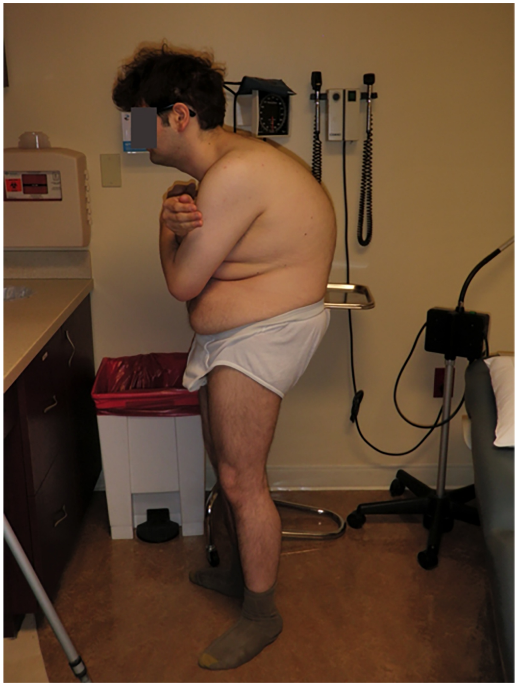
FIGURE 1: Preoperative Clinical Photograph

Lateral photograph demonstrating standing posture and kyphosis impairing horizontal gaze