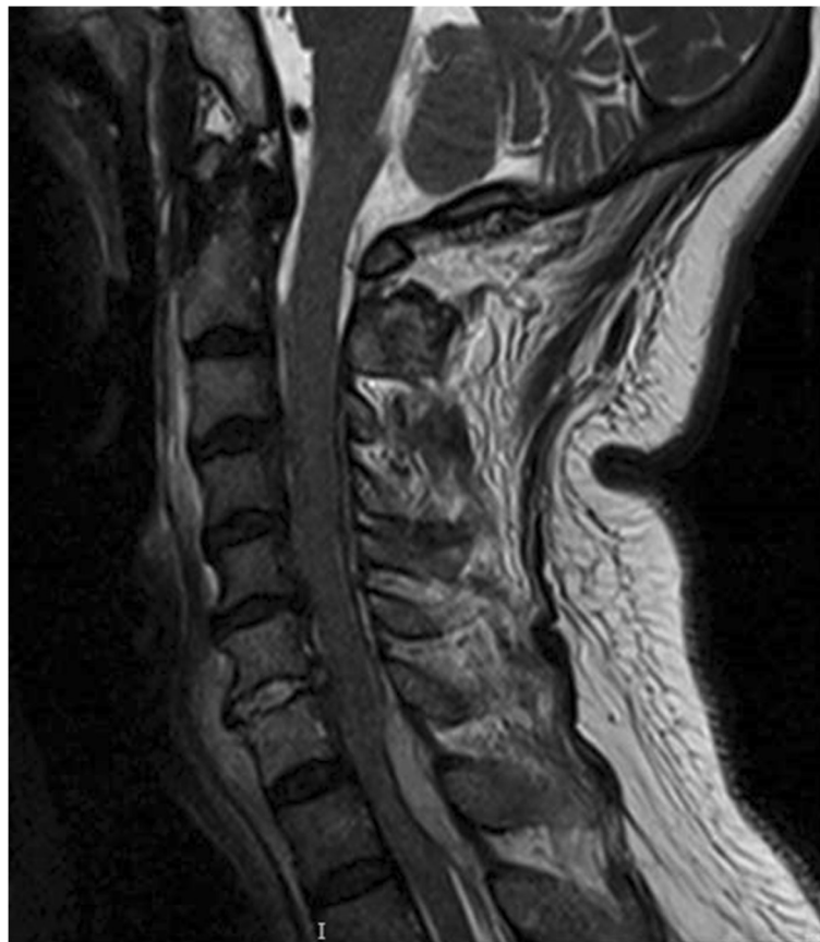
Fig. 1 Sagittal view of the cervical spine on MRI, showing the epidural abscess which is compressing on the cervical cord anteriorly

A spinal epidural abscess (SEA) is a pyogenic infection of the potential space between the vertebral body and dura mater of the spine. Although rare, their incidence has been rising gradually over the past decade, possibly