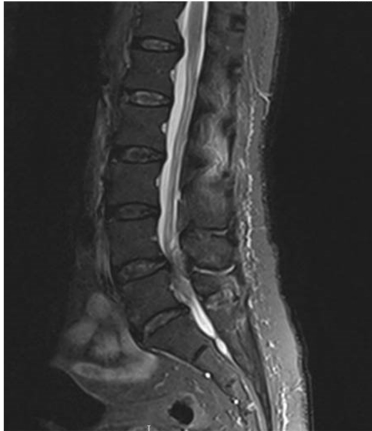
Fig. 3 The collection in the posterior epidural space and the posterior disc bulge is seen compressing the thecal sac and the cauda equina

prospective surveys [6]. The most common infection is hepatitis B (>60 %) due to transmission via contaminated needles. Only three cases of spinal infection were reported in this review.