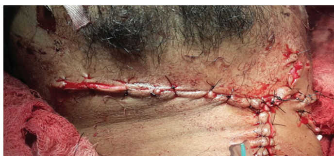
[Table/Fig-2]: Showing completed repair after skin closure.