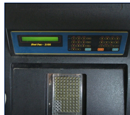
[Table/Fig-1]: Wells coated with test materials. [Table/Fig-2]: Transfer of brain heart infusion broth to the microtiter wells. [Table/Fig-3]: Elisa Reader (Stat Fax 2100) (Awareness Technology).