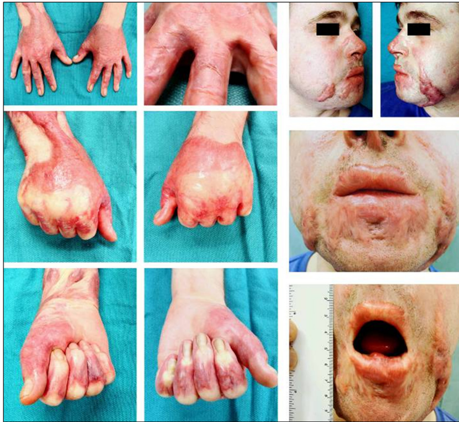
Fig. 1 Patients with HTS. A 24 year-old white man, 11 months after a 21 % TBSA burn. This patient developed HTS, resulting in cosmetic and functional problems that included restricted opening of mouth and tight web spaces of fingers that limited range of motion on hands (From Tredget EE, Levi B, Donelan MB. Biology and principles of scar management and burn reconstruction . Surg Clin North Am . 2014 Aug;94(4):793–815. With permission)

blood vessels. The new blood vessels differentiate into arteries and venules by recruitment of pericytes and smooth muscle cells [9]. Re-epithelialization is essential for the re-establishment of tissue integrity, which is ensured by local keratinocytes at the wound edges and epithelial stem cells from skin appendages such as hair follicles or sweat glands [10]. Granulation tissue formation is the last step in the proliferation phase, characterized by accumulation of a high density of fibroblasts, granulocytes, macrophages, capillaries and collagen bundles, which replace the provisional wound matrix formed during the inflammation stage. The predominant cells in this tissue are fibroblasts, which produce types I and III collagen and ECM substances, providing a structural framework for cell adhesion and differentiation [11]. Later, myofibroblasts induce wound contraction by virtue of their multiple attachment points to collagen and help to reduce the surface area of the scar [12].