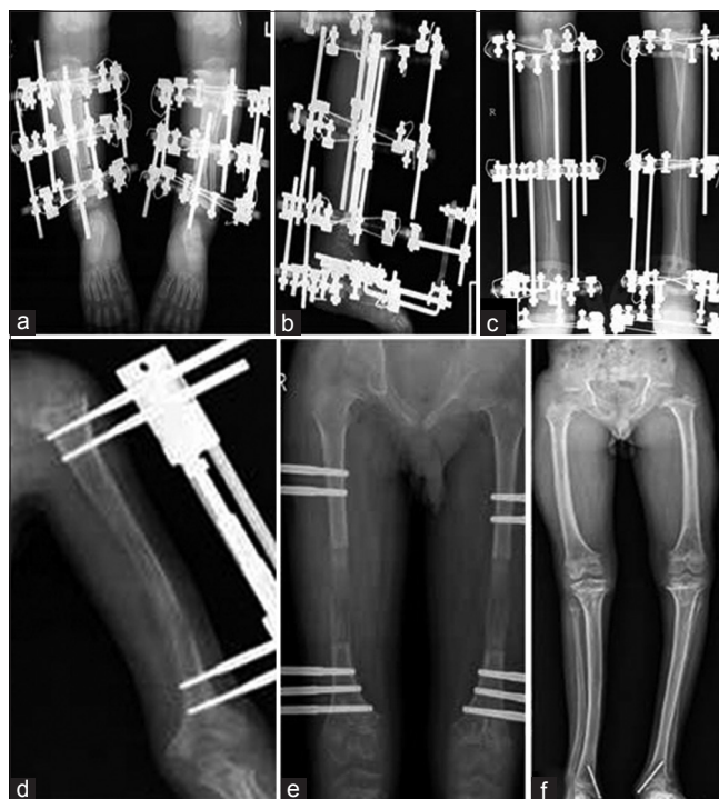
Figure 1: Radiographs (a-f) depict the lengthening started at age 5 and completed at age 10. (a) Three ring Ilizarov frame with bifocal corticotomy of tibia. (b) Frame is extended to the feet, and the proximal tibiofibular wire is added after fibula has descended to the appropriate level. (c) Tibia awaiting consolidation. (d) Humerus lengthening of 8 cm is carried out. (e) Finally, lengthening of the femur was carried out. (f) After 9 cm of lengthening at the femur and 20 cm of lengthening in the tibia. Note the medial ankle epiphysiodesis bilaterally to correct ankle valgus at age 11 years

For femur and humerus lengthening, a monolateral pediatric limb reconstruction system (Orthofix, Verona, Italy) was used, with mid-diaphyseal corticotomy for