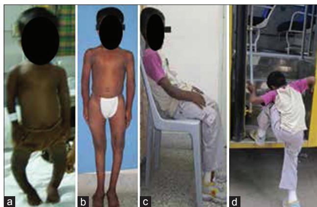
Figure 3: Clinical photographs before and after lengthening of the 11-year-old boy show the change in body proportion after lengthening and its effect on activities of daily living. (a) At 5 years, upper to lower segment ratio of 3.3 exaggerated by the presence of genu varum and hands reach the greater trochanters. (b) At age 11, after femoral and tibial lengthening, the ratio is 1.05, and the lengthened arms reach mid-thigh. (c) Child can sit on a normal chair with feet touching the ground and (d) He is able to board a school bus ed

Desired stature correction depends on ethnicity and local standards for stature. The overall goal should be to achieve a final height above the 3 rd percentile. Standard 3 rd percentile height is 148.3 cm for Indian girls and 161 cm for boys. 32 In our study, predicted heights (by Paley's chart and length added by surgeries) for five children who completed both long segments of the lower limbs were 140, 151 and 146 cm for 3 girls and 148 cm each for two boys.