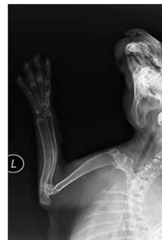
Figure 2: X-ray of the rabbits forearm anteroposterior view showing a large number of bone calluses had formed in the rabbits by 6–8 weeks in the bone fracture group