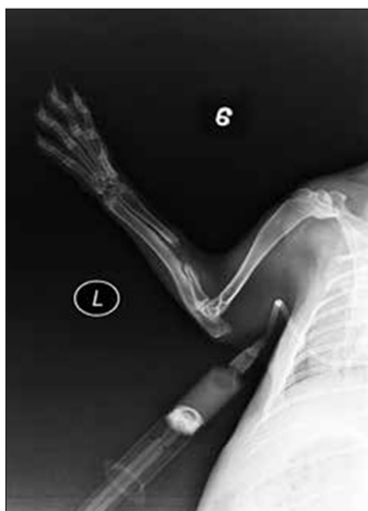
Figure 1: X-ray of the rabbit's forearm anteroposterior view showing none of the bones had healed at 8 weeks in the bone defect group

At present, the commonly used method to detect BMD is dual-energy X-ray absorptiometry, which is prone to be influenced by bone morphology and size. 4 Plain radiography