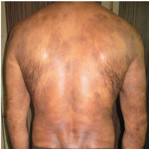
Figure 1. Mycosis fungoides in a 40-year-old man manifested as generalized atrophic patches.

MF, SS, and primary cutaneous peripheral T cell lymphomas not otherwise specified (PCTCL - NOS) are among the most important subtypes of the CTCLs 7,8 . MF is the commonest type of CTCLs, representing 44% to 62% of cases 9 . MF restricted to the skin has an indolent progression passing from macule and patch stage to infiltrated plaque and tumor stage (Figure 1) 5,10,11 in sun-protected body sites 12 . SS is defined as an aggressive leukemic-phase type of MF 11 , clinically characterized by erythroderma and generalized