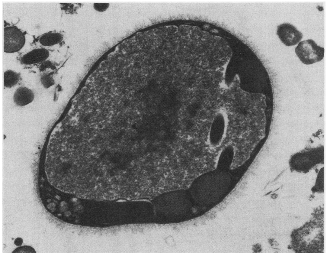
Figure 1 Blastocystis hominis organism identified in stools of patients by electron microscopy.

Microbiological examination of the stools was the single most useful investigation that identified all the cases of cryptosporidial infection (n = 11) and four of the six cases of giardiasis. Two other opportunistic pathogens presumed to have caused the diarrhoea ( Candida and Mycobacterium avium intracellulare [MAI])