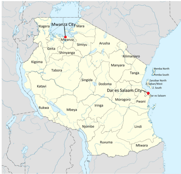
Figure 1. Map of Tanzania