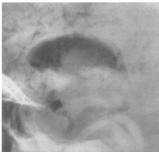
FIG. 2.—Lumbar air encephalogram. Lateral radiograph. Note enlarged pituitary fossa but complete absence of suprasellar extension: third ventricle undeformed.

Mental disturbances in the post-operative phase occurred in 20 cases out of 67 males with pituitary