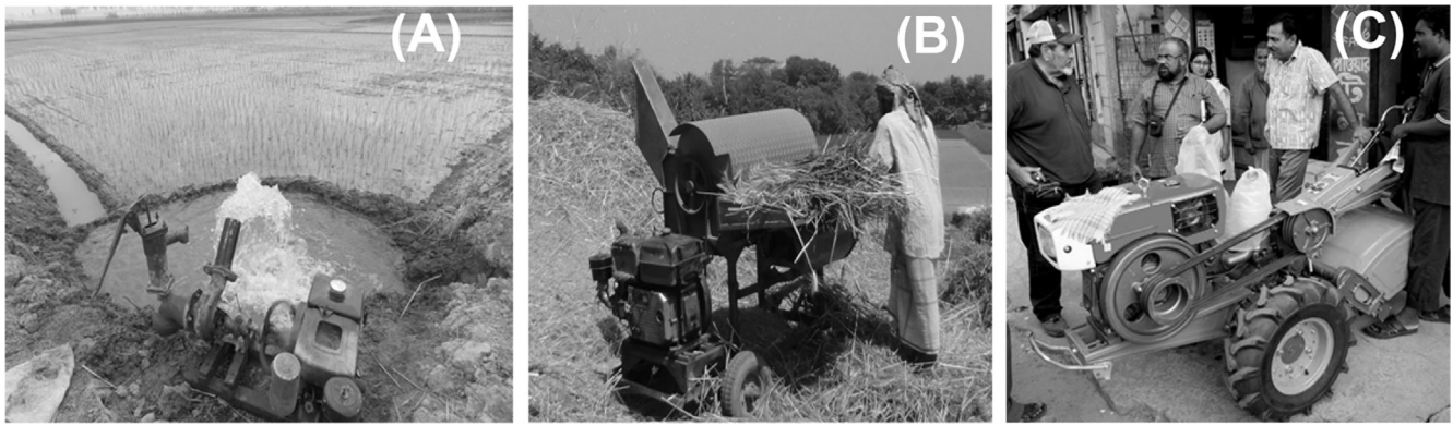
Fig. 1. Small-scale agricultural machines considered in this study. (A) shallow tube well driven by an irrigation pump, (B) rice and wheat thresher, (C) two-wheel tractor driven power tiller.