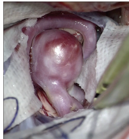
Figure 2: Intraoperative image of the same aneurysm with thinned wall