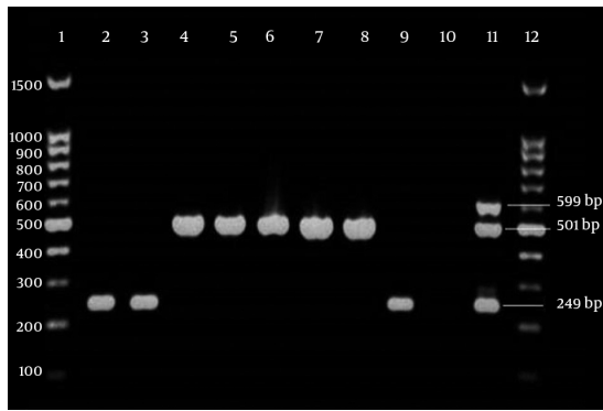
Figure 1. Agarose gel Showing OXAs Genes Obtained by Multiplex PCR

Lanes 1 and 12, 100 bp DNA ladder; lanes 2, 3 and 9, isolates with bla OXA-24-like in 249 bp; lanes 4 - 8, isolates with bla OXA-23-like in 501bp; lane 10, negative control (distilled water). lane 11, positive control Acinetobacter baumannii NCTC 13304, NCTC 13302 and NCTC 13305 were used as positive controls for bla OXA-23-like , bla OXA-24-like and bla OXA-58-like , respectively.