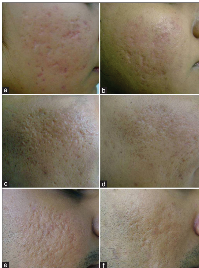
Figure 4: Pre (a, c, e) and post (b, d, f) treatment photographs of post-acne atrophic scar patients after 4 sittings of microneedling done 1 month apart