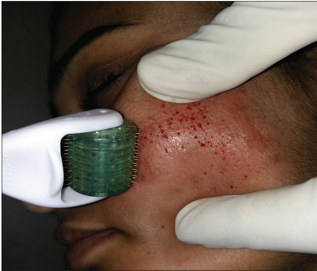
Figure 2: Pin-point bleeding over the cheek following microneedling procedure

packs can be used for comforting the patient. Thereafter, the patient is advised to use sunscreen regularly and follow sun-protective measures. The procedure is well-tolerated by the patients and there are usually no post-treatment sequelae except slight erythema and edema lasting for 2–3 days. There is no downtime and the patient can resume daily work the very next day. Treatments are performed at 3–8 week intervals and multiple sittings are needed to achieve the desired effect on the skin. The final results cannot be viewed immediately because new collagen continues to be laid down for approximately 3–6 months after treatment has ceased. [10,15]