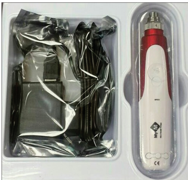
Figure 3: Dermapen with battery charger

DermaFrac treatment is a newer modification of microneedling combining microdermabrasion, microneedling, simultaneous deep tissue serum infusion, and light emitting diode (LED) therapy. DermaFrac treatments target aging and sun damaged skin, acne, enlarged pores, uneven skin tone, wrinkles,