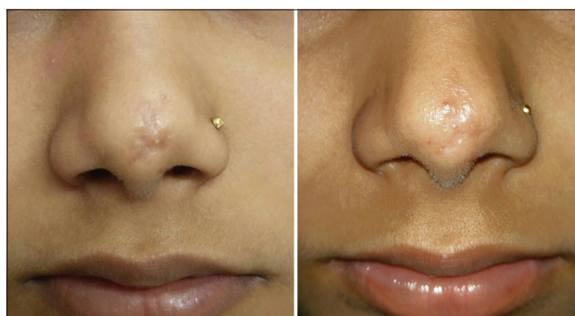
Figure 7: Significant improvement in post-traumatic scar over the nose after 1 sitting of subcision followed by 3 sittings of microneedling done 1 month apart