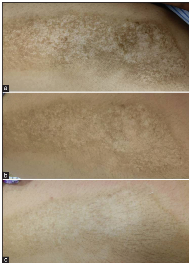
Figure 5: Post-burn scar on the thigh of 1 year duration treated with a combination of microneedling and laser (a) Baseline photograph; (b). Scar showing improvement after 3 fortnightly sessions of microneedling; (c) Further improvement in scar following 1 session of Fraxel laser RE: STORE SR 1500nm (Solta Medical, USA) with following parameters: 70 mj beam energy, 20% density, 8 passes.

has been combined with various skin lightening agents and chemical peels to reduce melasma as well as periorbital hypermelanosis [Table 6].