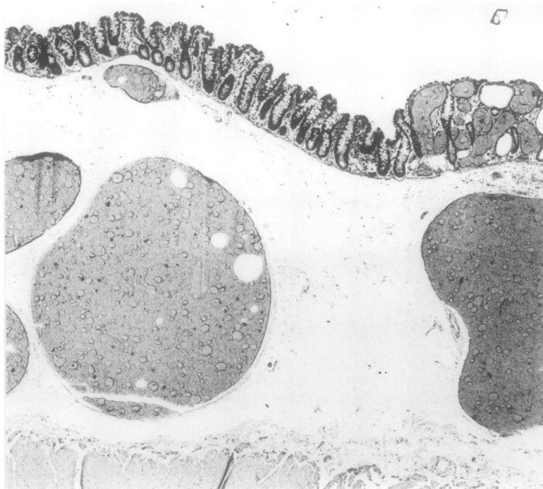
Fig. 3 Markedly ectatic submucosal vein draining an angiodysplasia \times 25