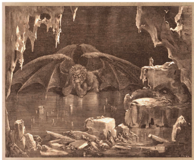
Figure 2. Satan. Modified from Dante Alighieri's Inferno from the Original by Dante Alighieri and illustrated with the designs of Gustave Doré – 1861.

MERS-CoV is phylogenetically related to SARS-CoV and share with SARS-CoV the origin in bats. 23,26,27 Several CoVs have been identified in insectivorous and frugivorous bat species in various countries, indicating that bats may represent an important reservoir of these viruses. 23 MERS-CoV was first identified in Saudi Arabia in 2012 and then spread to other countries causing hundreds of deaths. 26,28 Clinical features of MERS-CoV are similar to SARS-CoV, although this virus has also been associated with several extrapulmonary manifestations, such as severe renal complications. Recent studies have indicated that dromedary camels may be the intermediate hosts and potential source of the virus for humans. 26,29 In addition, the first experimental infection of bats with MERS-CoV has been described. The virus maintains the ability to replicate in the host without clinical signs of disease, supporting the general hypothesis that bats are the ancestral reservoir for MERS-CoV. 30 Human-to-human transmission has also been reported. Based on epidemiological data, both animal-to-human and human-to-human transmission are considered to be important elements in MERS outbreak. 26