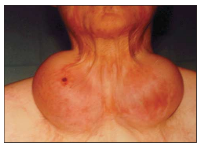
Expansion of normal skin by means of inflatable prostheses implanted in subcutaneous tissue. These are inflated with saline over several weeks until enough extra skin has been created. The expanded skin is then mobilised as full thickness skin grafts, regional advancement flaps, or free flaps. These provide large amounts of normal skin to resurface scarred areas