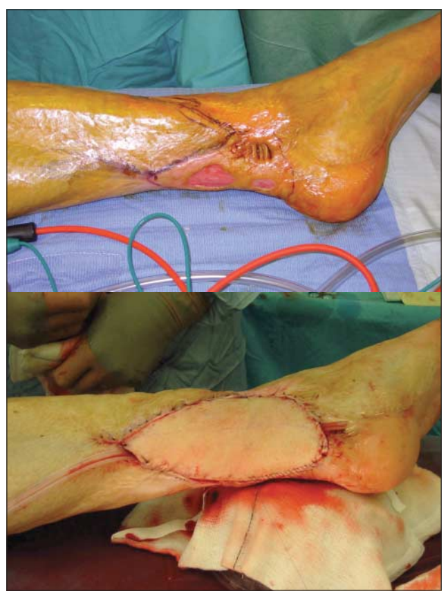
Top: Unstable burn scars with chronic open wounds on medial malleolus. Bottom: The scars were excised and the defect reconstructed with a free vascularised perforator based skin flap. In this case skin from the thigh was transplanted to the ankle with microsurgical vascular anastomosis. These techniques allow the transplantation of any tissue (skin, fascia, fat, functional muscle, and bone) in the same patient

Burn reconstructive surgery has advanced in recent decades, though not as dramatically as in other areas of plastic surgery. For many years, burn reconstructive surgery comprised incisional or excisional releases of scars and skin autografting. Nowadays, however, the first approach that should be considered is use of local or regional flaps. These provide new