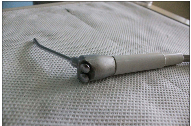
Figure 9: Three way syringe