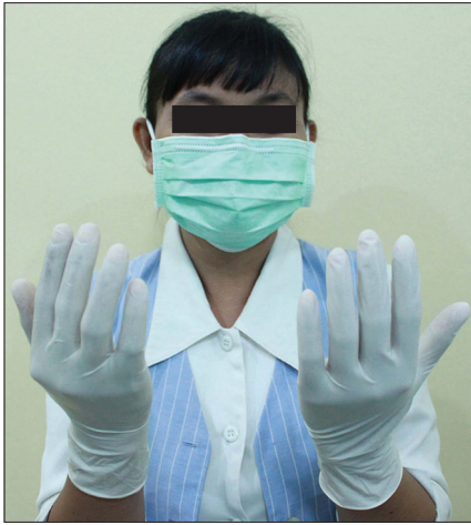
Figure 4: Dental nurse with mask and gloves