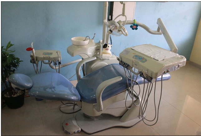
Figure 6: Reclined dental seat position