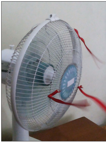
Figure 8: Air fan