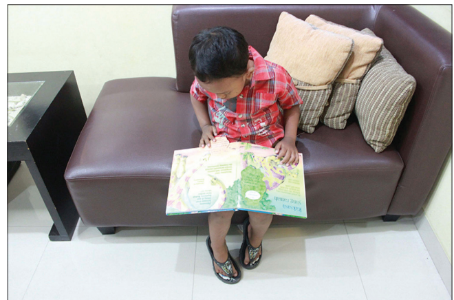
Figure 2: Children in waiting room