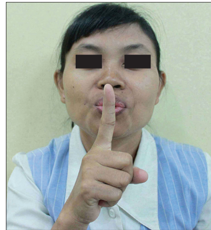
Figure 1: Quiet symbol

More than half of the participants were able to answer the question regarding dental chair with some help. The researcher and teacher had to modify the question. The participants said that the dental chair was able to move to “sleep position,” but could not distinguish between the two pictures of upright and reclined seat position [Figures 5 and 6].