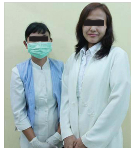
Figure 3: Dentist and dental nurse

Adult participants suggested revision for dental chair pictures. Comparison between upright and reclined position should be made more clear. According to them a child sitting in upright or reclined seat were more obvious than empty upright or reclined dental chair.