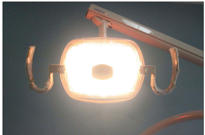
Figure 13: The lamp is on

elicit more robust response in children with ASD than in typical developing individuals having strong hobby or interest. [18] This was taken to also suggest that brain regions related to social functioning may not be inherently less responsive in ASD but rather recruited by different environmental stimuli. In this study, we addressed the visual perception regarding dental visit