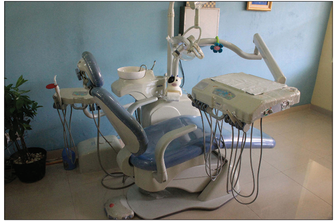
Figure 5: Upright dental seat position