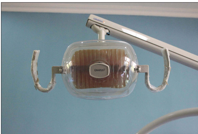
Figure 12: The lamp is off