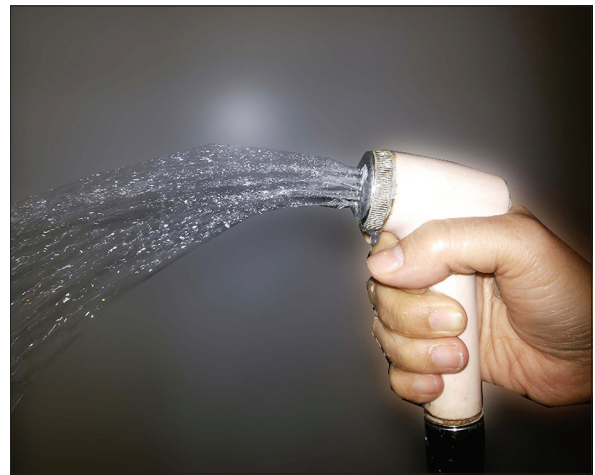
Figure 7: Water sprayer