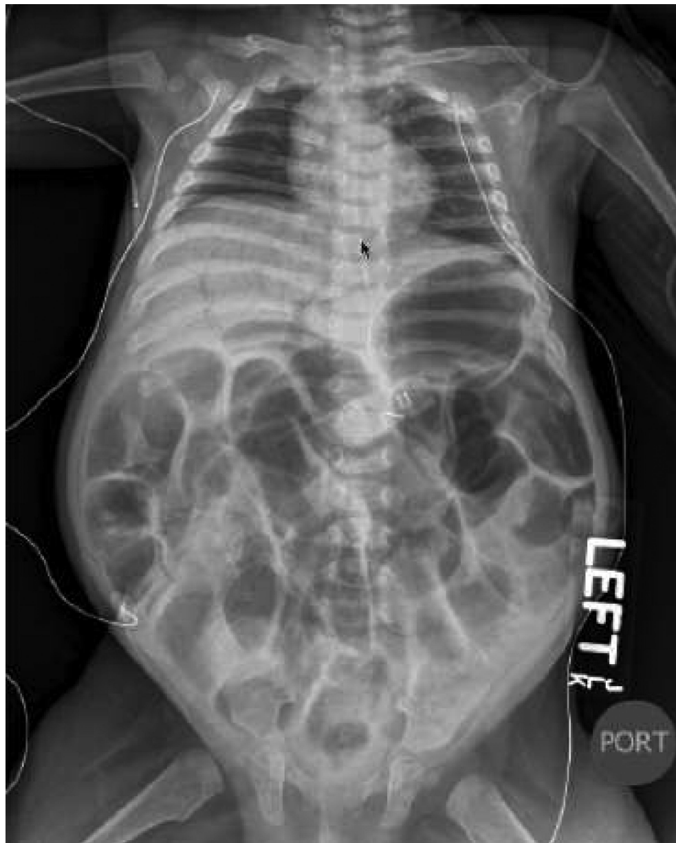
Figure 2. Abdominal radiograph on presentation with necrotizing enterocolitis. Notable features include generalized bowel loop distention, intestinal intramural pneumatosis, portal venous air, and pneumoperitoneum.