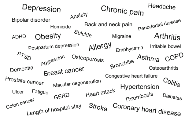
Fig. 2 Health conditions linked to the highly unsaturated fatty acid (HUFA) balance. ADHD attention deficit–hyperactivity disorder, COPD chronic obstructive pulmonary disease, GERD gastroesophageal reflux disease, PTSD post-traumatic stress disorder

Occupational medicine experts have identified dozens of chronic health conditions other than CVD that cause major health-related financial losses for US corporations [15, 16]. Many of these conditions (see Table 1 in Ref. [8]) are made worse by excessive n-6 actions, and the HUFA balance is linked to financial loss (see Fig. 2 in Ref. [14]). The balance of n-3 and n-6 HUFA in blood lipids [17] is a valuable surrogate for monitoring food-based interventions. Ironically, CVD (the top cause of death) is not among the top ten conditions causing health-related financial losses (see Fig. 1 in Ref. [15]), and many other food-based health conditions with excessive actions of n-6 eicosanoids [16, 18] cause the top ten financial losses [15]. Interventions with fish oil that lower the HUFA balance and the prevalence of CVD and n-6-mediated comorbid conditions will likely give large overall benefits measured in terms of lower health-related financial losses and a greater sense of wellbeing [14, 16, 18].